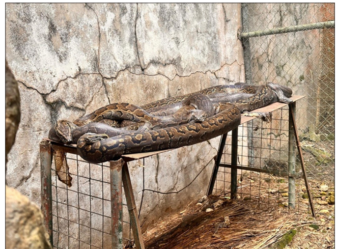
Figure 1: Four (4) African rock pythons ( Python sebae ) in their abode at the Jos Wildlife Park.

The second visit to the snakes occurred 2 weeks after the first. During this visit, handling and physical examination were carried out as described earlier. The snakes were treated using 1% ivermectin (Interchemie werken "De Adelaar" B.