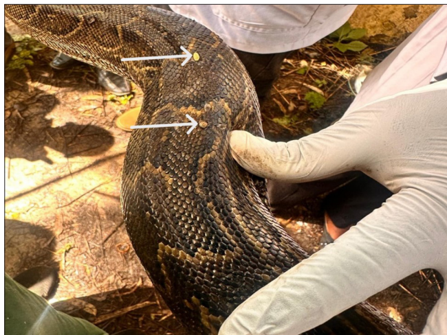
Figure 2: African rock python ( Python sebae ) showing ticks (white arrows) on the skin.