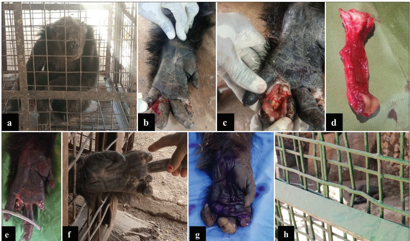
Figure 1: Appraisal of digital amputation and wound management in an adult female chimpanzee. (a) Captured chimpanzee in a squeeze cage immediately following administration of anesthetics, (b) wound appearing desiccated before cleansing, (c) wound appearance after cleansing with soap, water and antiseptics, (d) disarticulated first phalanx of the left ring digit, (e) appearance of left-hand immediately following amputation of index and ring digits, (f) significantly healed wounds 2 weeks post-operation, (g) appearance 4 weeks post-operation, and (h) chimpanzee in the Zoo's sanctuary setting on day 42 post-operation.

The chimpanzee was lured into a squeeze cage, immobilized, and anesthetized [Figure 1a]. Analgesia and anesthesia were, respectively, achieved using Pentazocine (Pentalab® - Laborate Pharmaceuticals Ltd., India) at 1 mg/kg intramuscularly and 50 mg/mL ketamine hydrochloride (Jawa ketamine® - Swiss Parenterals Ltd., Gujarat, India) at 12 mg/kg + 2% Xylazine (Alfasan, Woerden-Holland) at 0.2 mg/kg intramuscularly. Three milliliters of whole blood was collected and dispensed into anticoagulant (Ethylenediamine tetraacetic acid) containing sample bottles which were used for hematology by an automated hematology analyzer (Mindray® BC-3600, Shenzhen, China). Critical assessment of the wound